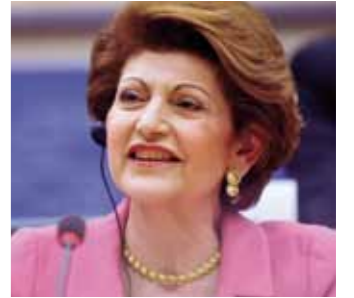
Androulla Vassiliou Commissioner in charge of Education, Training, Culture and Youth

I hope these stories will inspire students and higher education institutions alike to make the most of the opportunities available through Erasmus; the more we use and improve Erasmus, the closer we get to our goal of harnessing the benefits of learning mobility to give every young European a flying start in life.